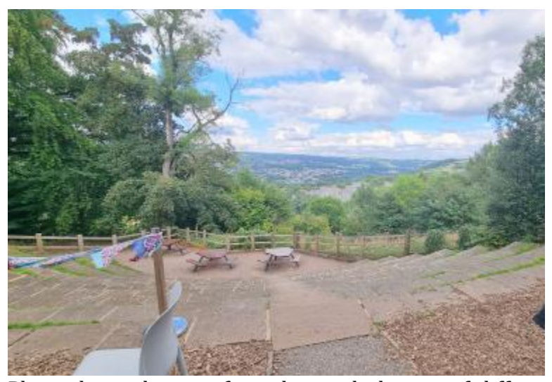
Photo shows the view from the amphitheatre, of cliffs, woodlands and a town. There are some steps and benches.