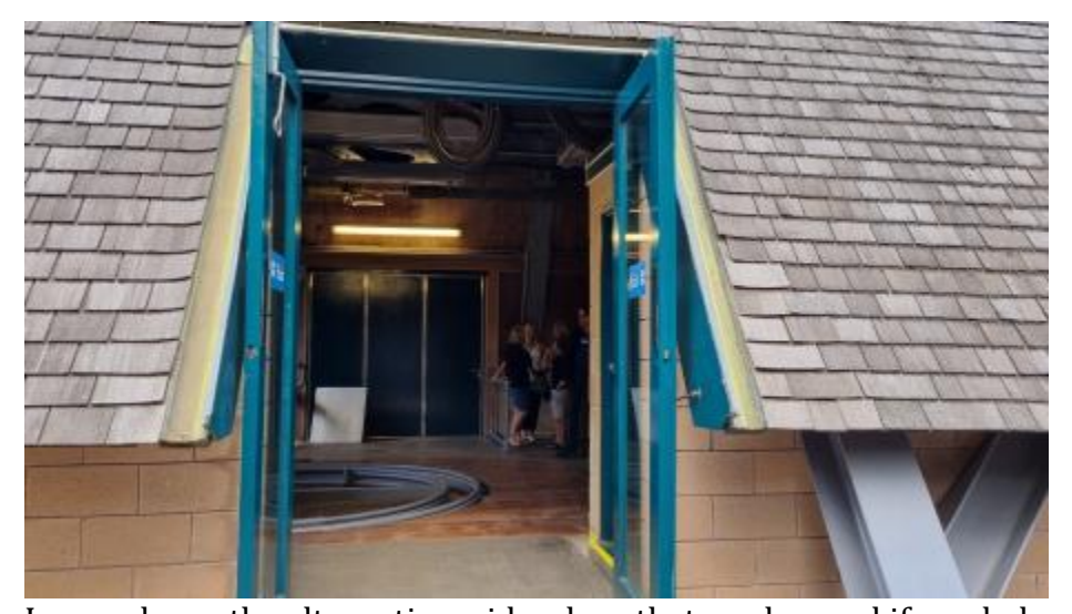
Image shows the alternative wider door that can be used if needed, not the main entrance.