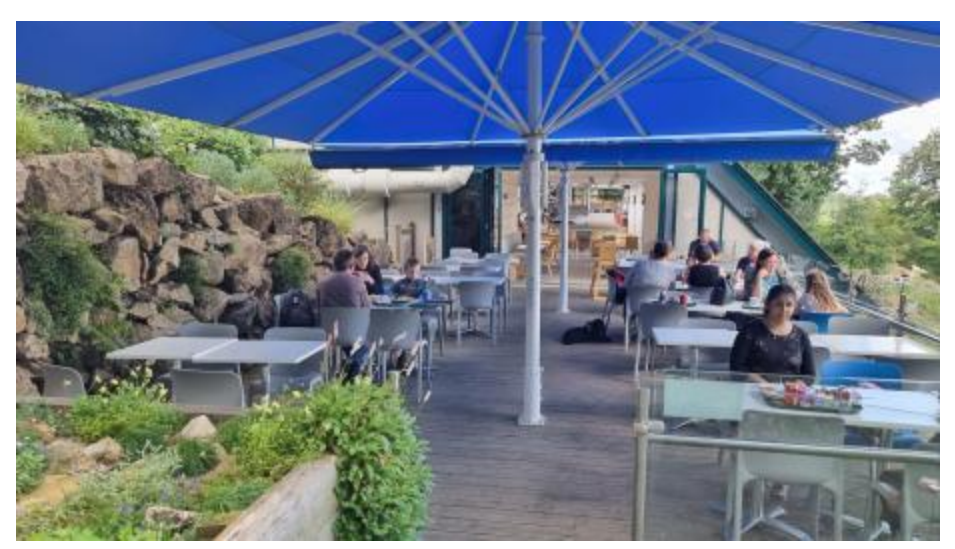
Photo shows the outdoor terrace, with a blue parasol providing shade. There are 12 tables.