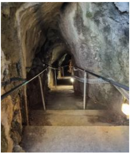
Photo shows the steps underground, and the uneven surface of the floor in the cavern. There is a handrail.

Photo shows some stone steps down into the Masson Cavern at the cavern entrance..