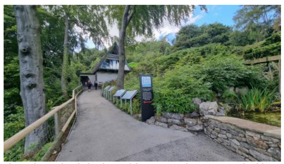
Photo shows the slight slope of the route to the Long View building, with the white and green building in the background.

There is also a gift shop here selling rock-themed souvenirs. This is accessed the same way that you acvoess the film theatre.