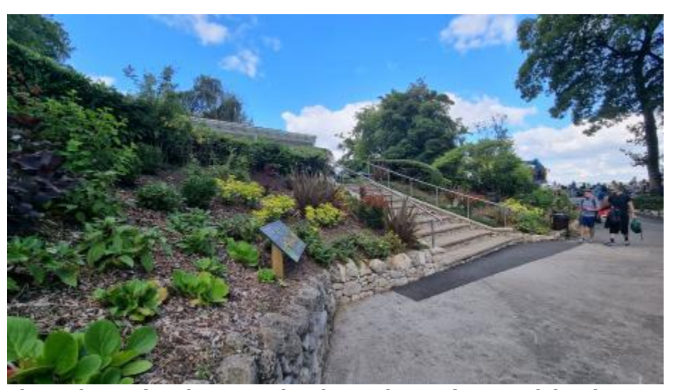
Photo shows the Alpine Garden, located on a slope, with level access to the right and steps in the middle.