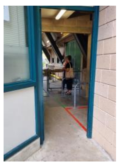
Image shows the main entrance door, which is always left open. The door is surrounded by a dark green frame.

Image shows the alternative wider door that can be used if needed, not the main entrance.