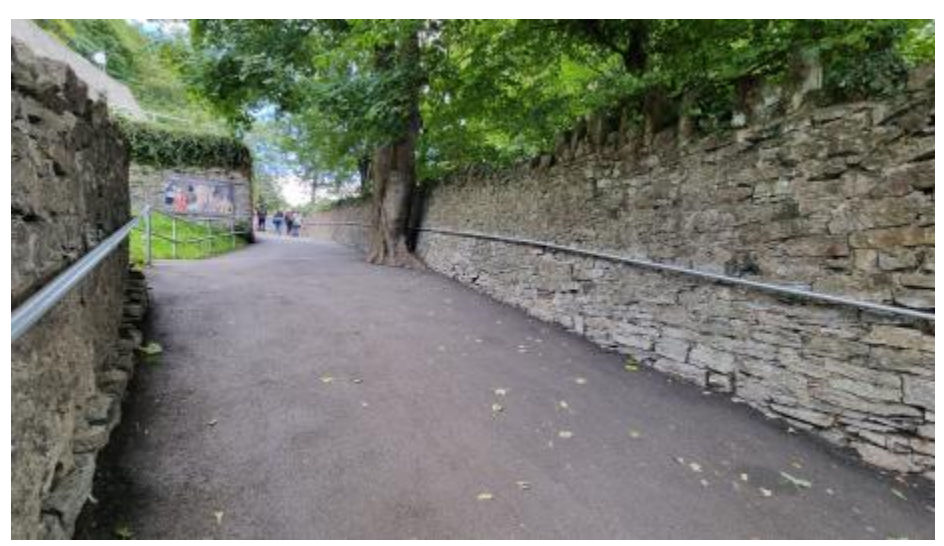
Photo shows the steep pathway leading to the main entrance. There is a handrail to the right.

If you are not able to ascend the slope, please speak to a member of staff who will advise you on what to do.