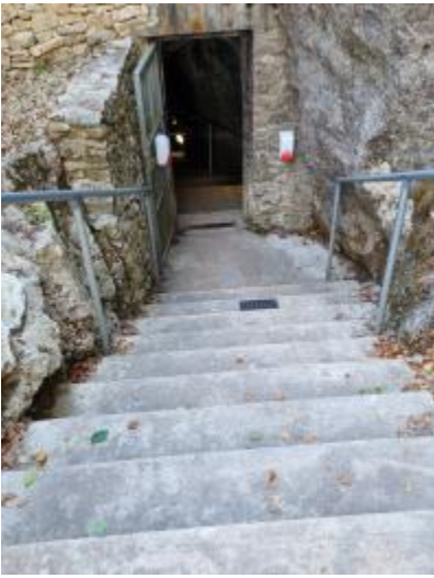
Photo shows some stone steps down into the Masson Cavern at the cavern entrance..