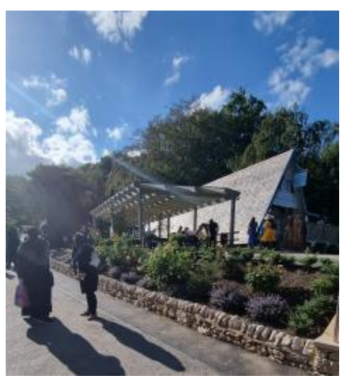
Photo shows the small rose garden on the right with a small walled border. This is on a slope.