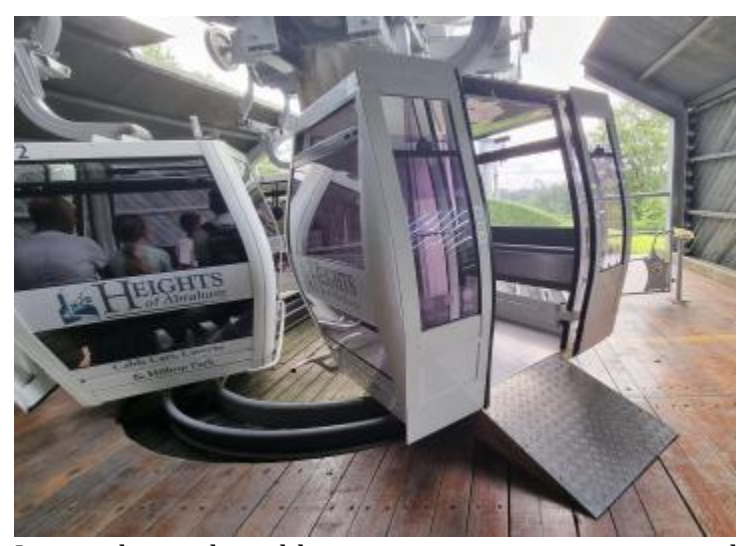
Image shows the cable car in stationary position, with the doors open and a temporary ramp in place.