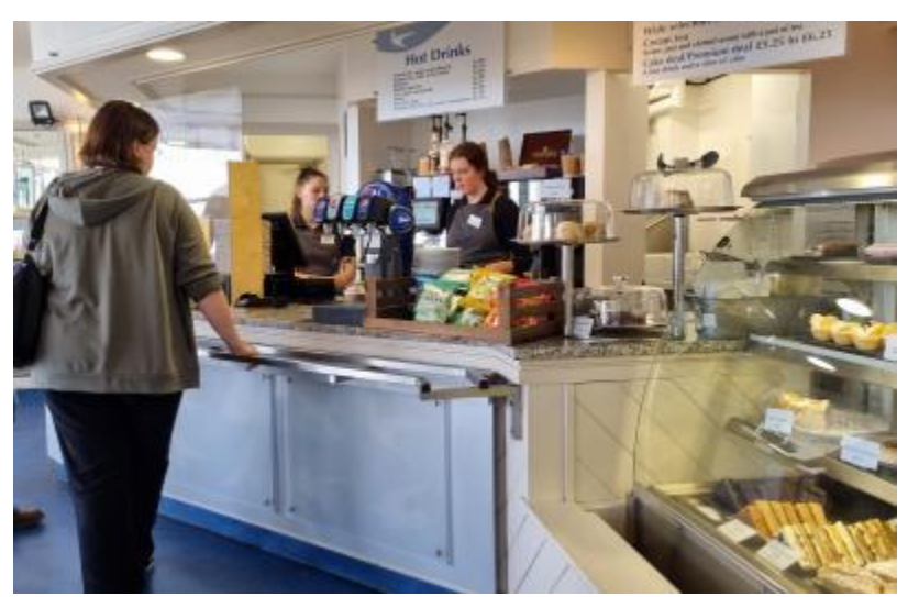
Photo shows the counter of the cafe, with a glass cabinet with various food items, a self serve drink machine and a tray rail.