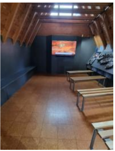
Photo shows the inside of the film theatre, with benches on the right and space on the left. Screen in the centre.