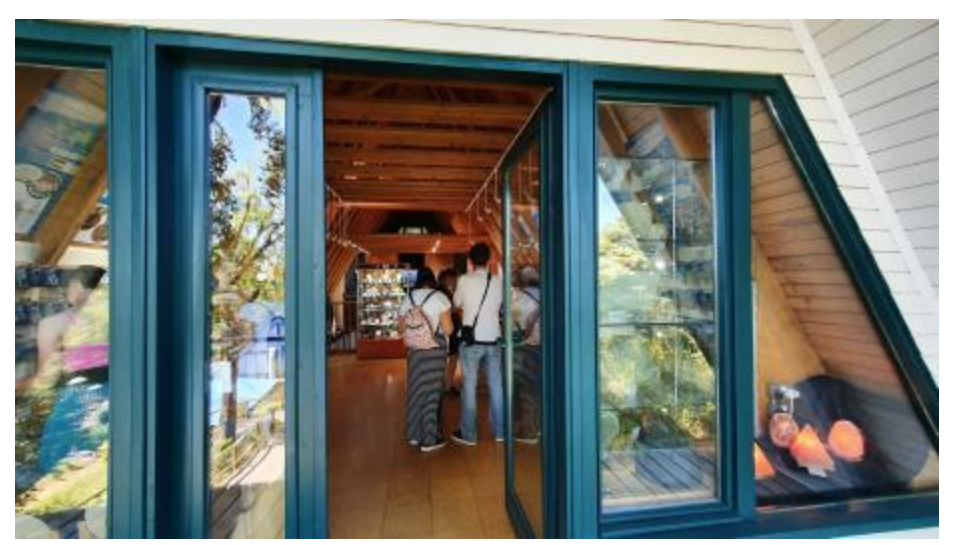
Photo gives a look into the Rockshop, with salt lamps, space inside, and a jewellery cabinet in the background.