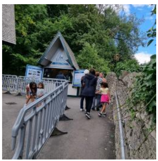
Photo shows the ticket office- a small building with a triangle shaped roof. There is a grey barrier to split the footpath.