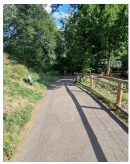
Image shows the steep pathway down to the Tavern and Rutland Cavern.

• The Tavern and Rutland Cavern are located down the hillside, down a very steep slope. We do not recommend that those with reduced mobility, or those who use wheelchairs and mobility scooters go down to this section of the estate, as it is extremely steep and a challenging climb back up.