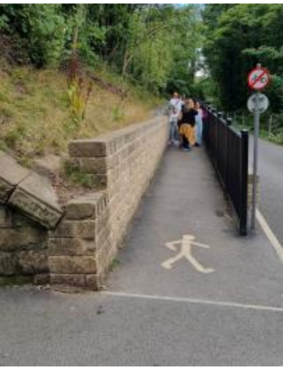
Photo shows the pedestrian route to the Heights, with a railing on the right to separate from the access road.