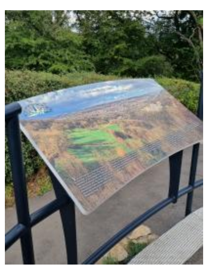
Photo shows one of the information panels, depicting the scenic view from the top of the tower.

Photo shows the Victoria Prospect Tower, a grey vertical tower made from stone with a Union Jack flying from the top.