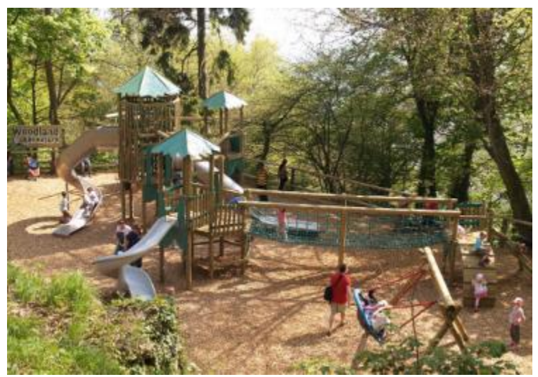
Photo shows the Woodland Adventure playground, with slides, climbing frames and swings.

• There are two adventure playgrounds for children to enjoy. The Explorer's Challenge is accessed by a flat pathway at the summit. The Woodland Adventure is a little down the hillside, accessed by a steep slope which is not suitable for those with limited mobility.