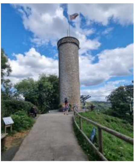
Photo shows the Victoria Prospect Tower, a grey vertical tower made from stone with a Union Jack flying from the top.

• The Victoria Prospect Tower is a monument built in 1844 to celebrate Queen Victoria's reign. The tower is comprised of a spiral staircase, with a viewpoint at the top. There are information panels at the bottom, showing visual images of the view from the top, without the need to ascend.